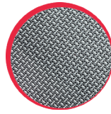
Abrasion-resistant fabric reinforcements

MATERIAL: 35% cotton, 65% polyester, 270 g/m 2 ; 60% cotton, 40% polyester, 270 g/m 2 . Double-stitched reflective bands in accordance with EN ISO 20471 standard. Additional reflective inserts increasing safety during work. 5 pockets, including 2 with a zipper. Triple seams. Yoke and pockets reinforced with an abrasion-resistant material (500D polyester). The jacket bottom and sleeves adjustment with a velcro fastener. Slim fit. Fashionable and interesting design. ID tag. STANDARD: EN ISO 13688, EN ISO 20471.