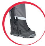
Adjustable leg width