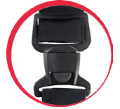
Special buckle construction to avoid loosening