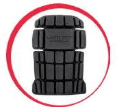
Knee pads for protective trousers and bibpants