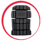
Knee pads for protective trousers and bibpants