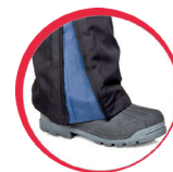
Adjustable leg width