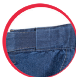
Innovative waist width regulation