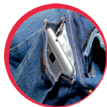
Electromagnetic radiation protection

MATERIAL: 70% cotton, 28% polyester, 2% elastane. 12 pockets, including 2 with a press stud. Pocket for a mobile phone protected with an EMF shield fabric. Fabric with stretch provides elasticity and comfort of use. Double seams. Additional seams reinforcement in the crotch. Innovative waist width adjustment with a special construction with an elastic band. Keychain hole. Hammer holder. Belt loops. Pockets reinforced with an abrasion-resistant material (600D polyester). Slim fit. Fashionable and interesting design. ID tag. STANDARD: EN ISO 13688.