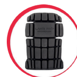
Knee pads for protective trousers and bibpants